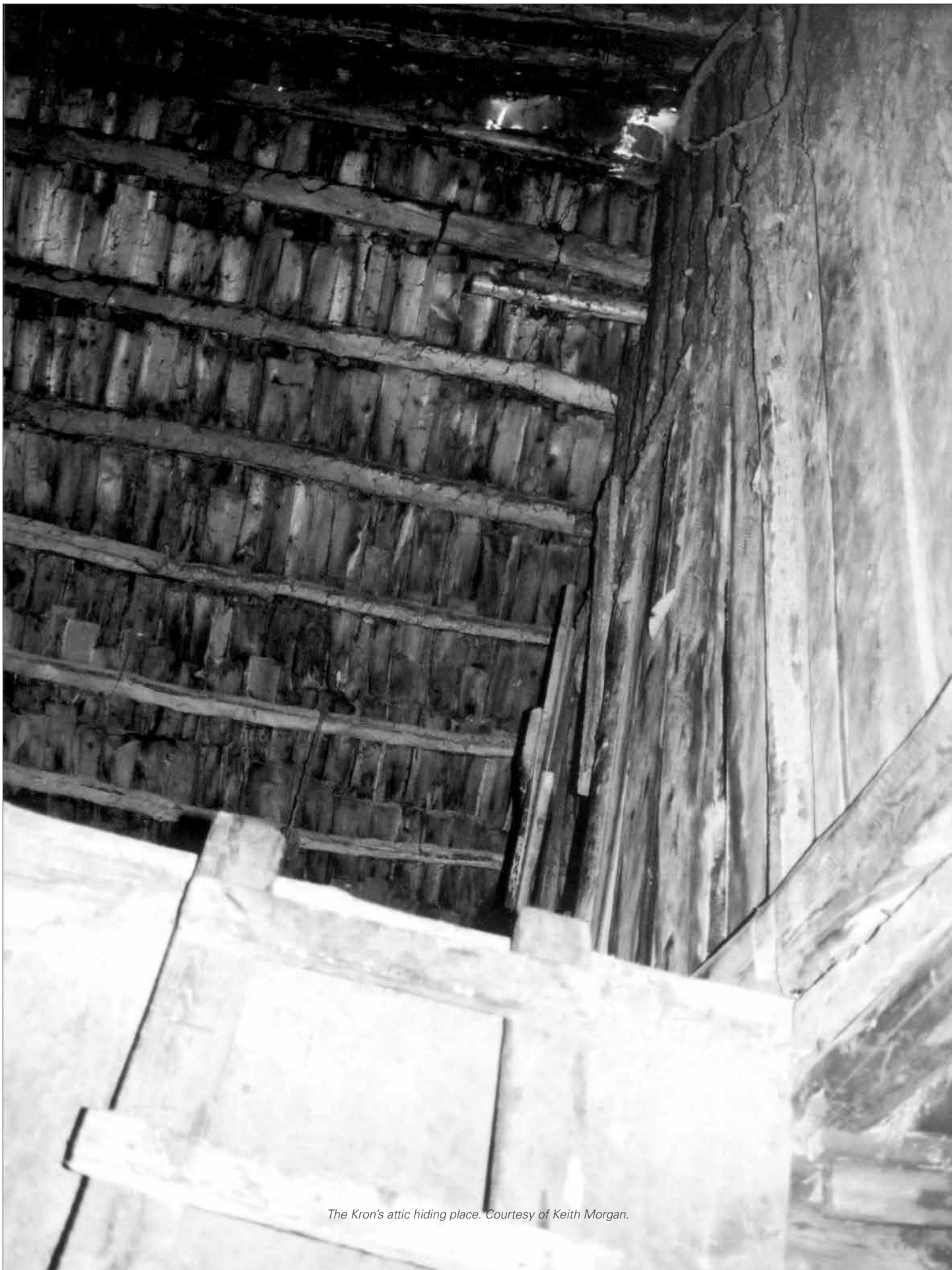
The Kron's attic hiding place.